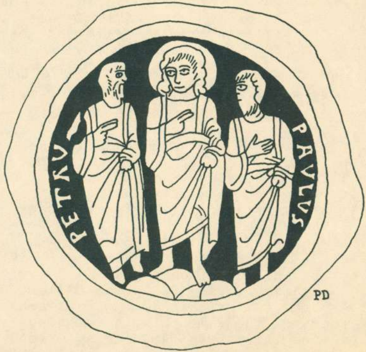
REPLICA OF A 4 TH CENTURY CHRISTIAN MEMORIAL GLASS