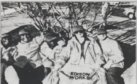
Reclamation of abandoned garden at corner of West Main and Brown Streets began Fall 2000