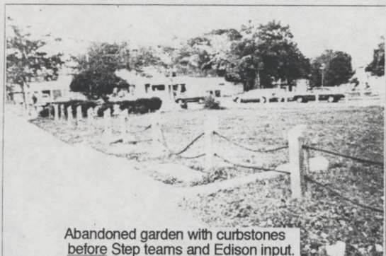
Abandoned garden with curbstones before Step teams and Edison input.