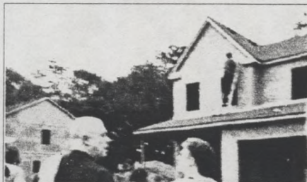
New housing along Brown Street made possible by Providence Housing