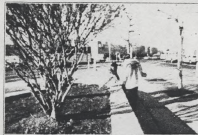
Crocuses emerge Spring 2001