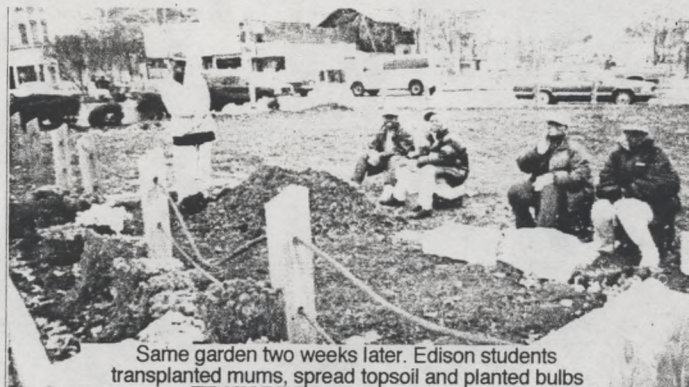
Same garden two weeks later. Edison students transplanted mums, spread topsoil and planted bulbs