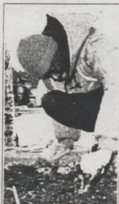
Tulip bulb planting Oct.2000