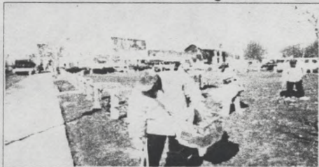
West Main & Brown Street clean-up in early spring 2001 after snow cleared