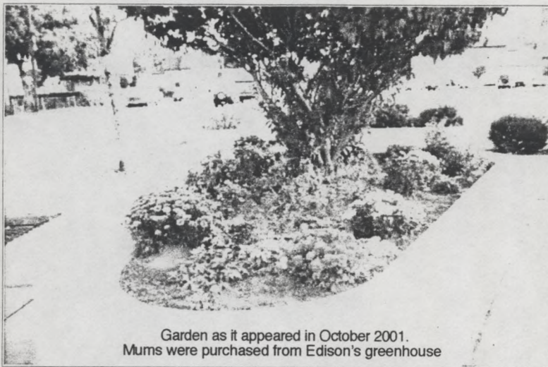
Garden as it appeared in October 2001. Mums were purchased from Edison's greenhouse